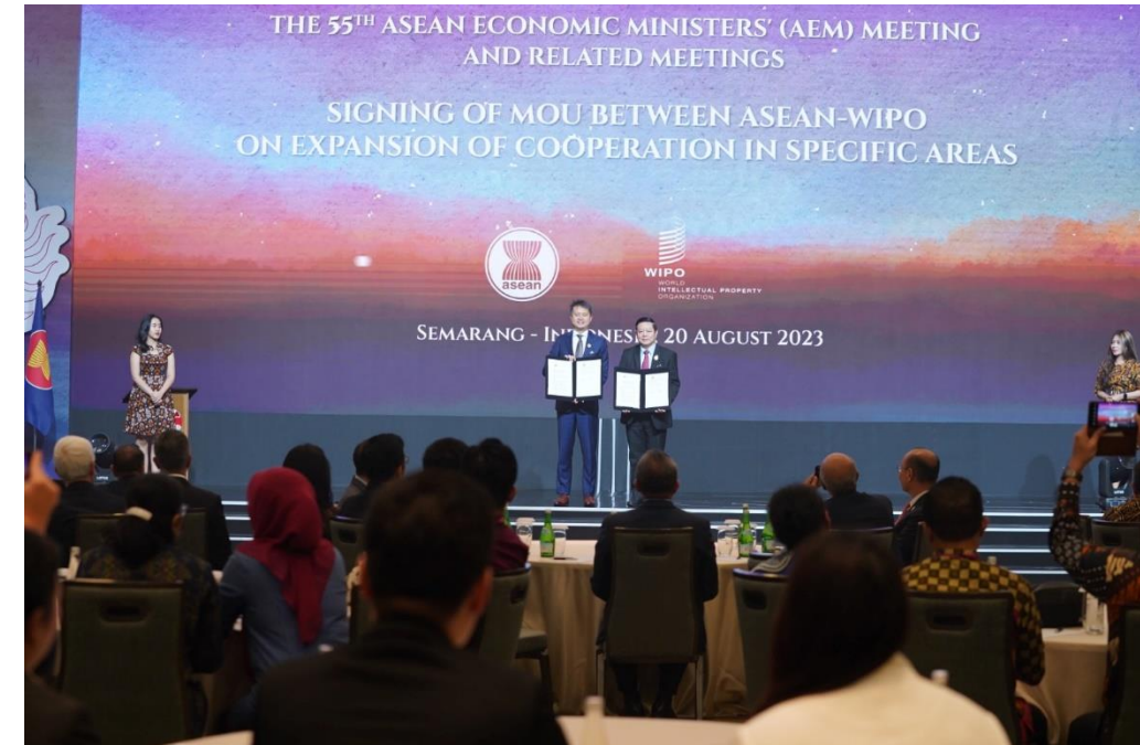
Signed in Semarang, Indonesia, 20 August 2023

“...a forward-looking agreement with ASEAN to expand the use of intellectual property (IP) in supporting economic, social and cultural development across the region...”