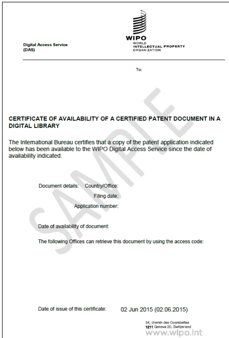
Figure 5 – Example of DAS Certificate

The system allows you to view or download a certificate of availability to confirm that the copy of the application is available in DAS. This may be useful either as confirmation in your files, or to provide evidence to an Office that you have taken all the necessary steps to make the document available to them by the appropriate date and that any delays due to system problems, such as the digital library of the Office of First Filing being temporarily unavailable, were not your fault. You can select whether such a certificate covers one, some or all of the Offices to which access has been granted. The system permits Offices to retrieve a similar certificate for themselves covering only the access which has been given to that Office.